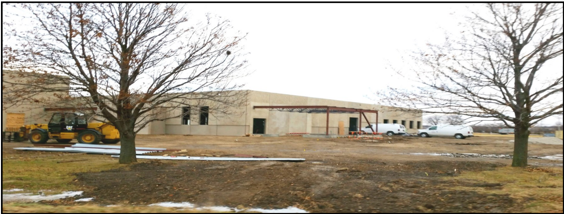
View of the northwest side of the lab with attached evidence delivery sally port