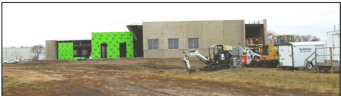
View of the east side of the lab