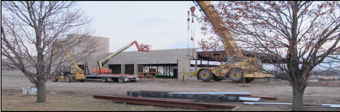
View of the front of the lab from the northwest corner