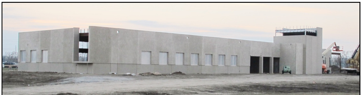
View of the front of the lab from the northeast corner